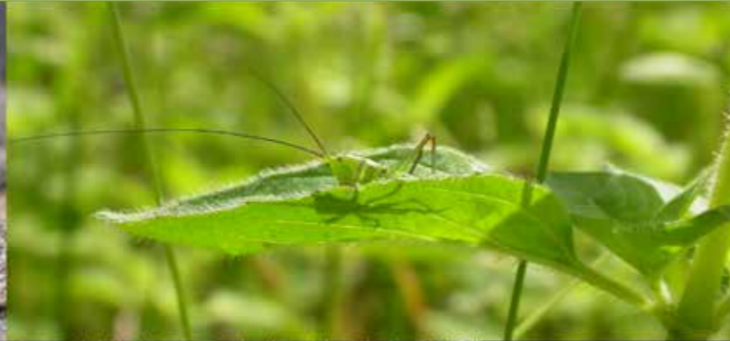
A young long-winged conehead peers from a wild marjoram leaf