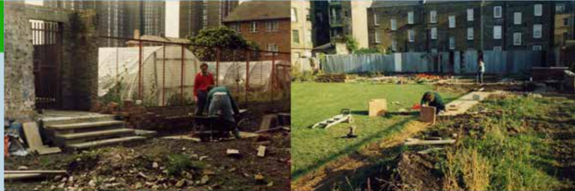
Developing the site of the Wildlife Garden 1987 - 2003