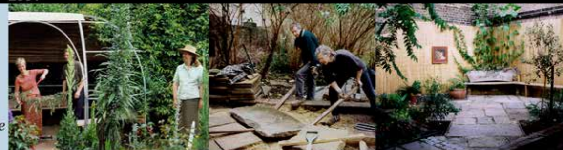
In 1994-5 it started its life as a Wildlife Garden, but its full development as an educational and urban biodiversity resource began to be realised from 1999.