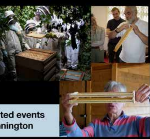
Unexpected events in Kennington