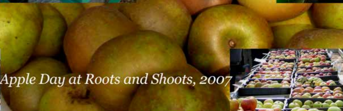
Apple Day at Roots and Shoots, 2007