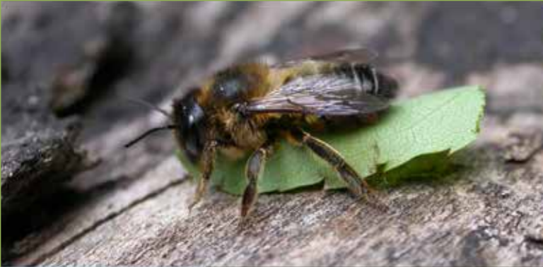
A female Leaf-cutter Bee with a piece of rose leaf for her nest