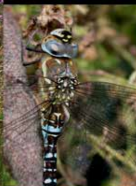
A male Migrant Hawker dragonfly rests on an Echium stem in September.