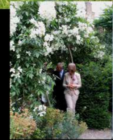
Royal visits 1988 / 2007