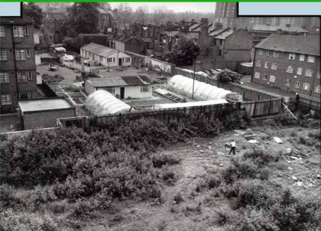
The Roots and Shoots site in 1985/6 - beginning to reclaim the site of the Wildlife Garden, left and ready to cultivate, bottom right.