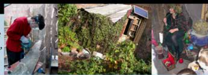
The main path layout was built in 1987 (top). A pond was added in 1989 with further projects from 1999 such as the espalier apple fence by the new apiary, the Children's Shelter and Paradise Corner (2001, built with Rob and Siriol, opened by Gay Search), the new path and gate (2002) and the Dragon's Den (with trainee, Jason 2003).