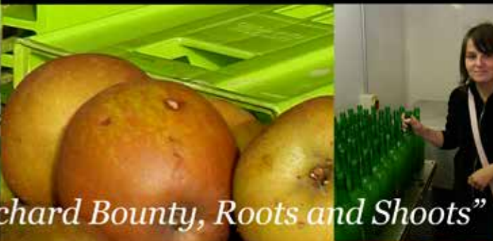
"Orchard Bounty, Roots and Shoots"